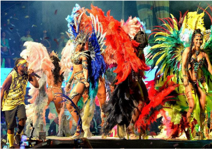
Going to fete?