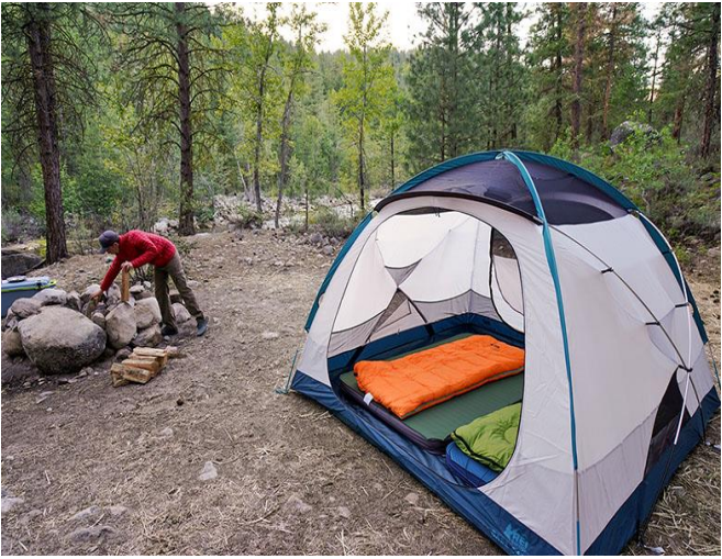
Going to Church Camp?